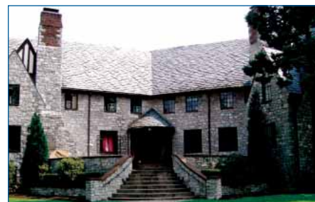
Will the Alpha Delta house reopen in 2010? You hold the key to the answer!