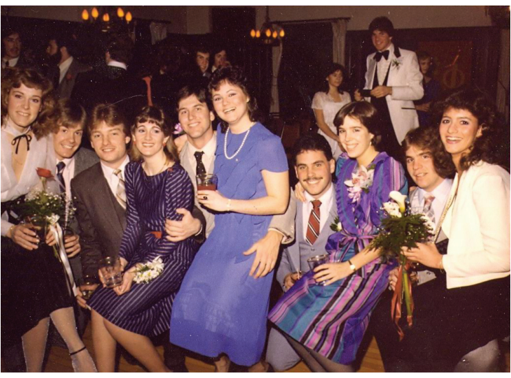
The Chi Phi house is much more than a structure, it houses memories that populate our life's photo album, like this memory from Champale 1983.