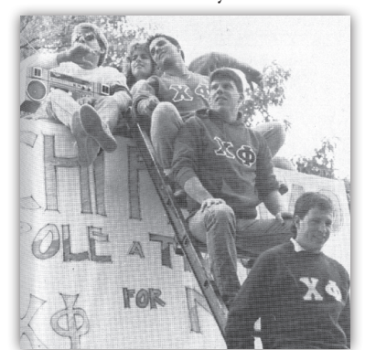
How many Chi Phis can you fit on a telephone pole? Pole-a-Thon 1988.

Let US be the judge! Share the best stories and photos from your era at www. chiphi-psu.org, and we'll publish the best of the best in upcoming issues of the ADD and in our monthly e-Letter.